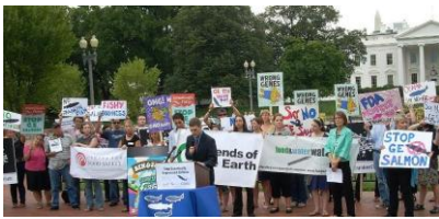
White House Demonstration against GE Salmon, Sept. 16